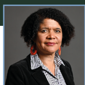
Chi Onwurah MP